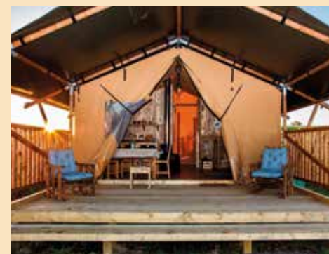
Under the Oak Glamping