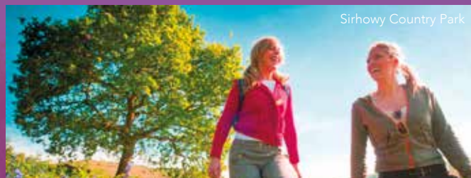
Sirhowy Country Park

If you're looking for the perfect picnic spot or somewhere to kick a ball, dappled woods to wander through, or riverbanks to ramble down, or safe paths to cycle along then look no further than one of the five country parks in Caerphilly county borough. Enjoy a stroll around the serene lake at Cwmcarn Forest or climb Twmbarlwm if you're feeling more energetic!