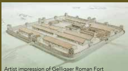
Artist impression of Gelligaer Roman Fort

Almost 2000 years after the Romans and Silures battled across these hills, Gelligaer is again telling the story of the Romans in the Valleys of South Wales. Why not come and visit this village, which has a history that stretches back to prehistory, and a heritage waiting for you to explore.