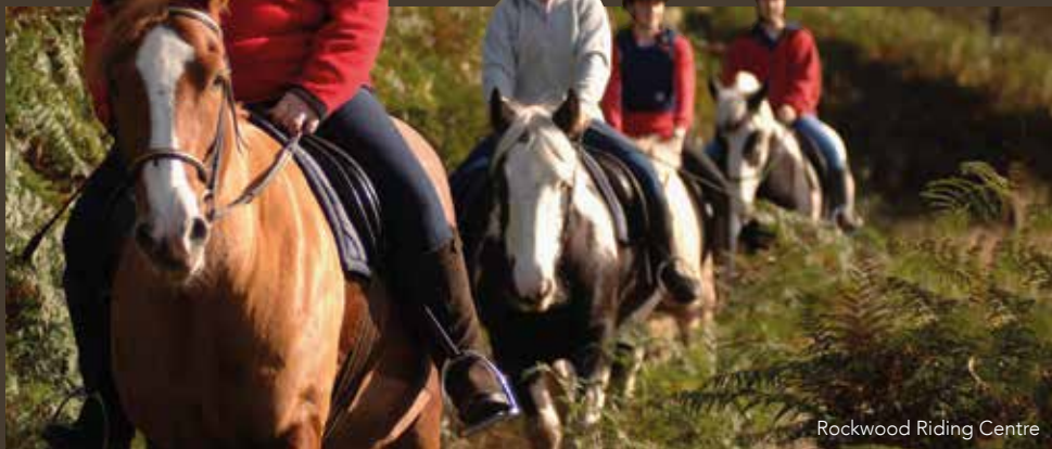
Rockwood Riding Centre