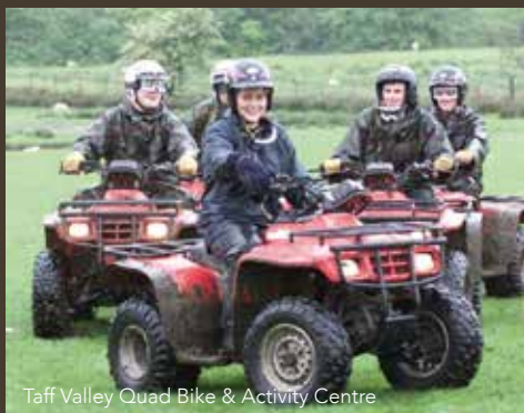
Taff Valley Quad Bike & Activity Centre