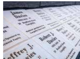
Senghenydd National Mining Memorial

Commemorating the fallen of the 152 mining disasters across Wales, the National Mining Memorial was unveiled on the centenary of the Universal Colliery Disaster in Senghenydd on the 14th October 2013. The memorial incorporates a bronze statue, wall of remembrance & path of memory within the memorial garden, dedicating a ceramic tile to each disaster.