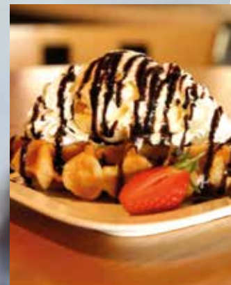
Casa Mia Restaurant & Cocktail Bar