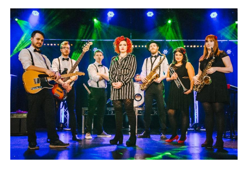
Follow The Pandas on <u>Facebook</u>. Listen to The Pandas' music on <u>Facebook</u>.

This 7-piece soul party band has been playing all over South Wales and further afield since 2009. The Pandas stand out from the average cover band with their classic setlist, powerhouse female vocals and full horn section. Expect everything from Stevie Wonder to Amy Winehouse.